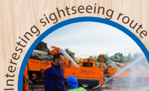
Interesting sightseeing route

You are invited to participate in the "Clean up the World" campaign!