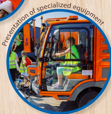
Presentation of specialized equipment